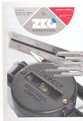
ZKG directional compass for engineers