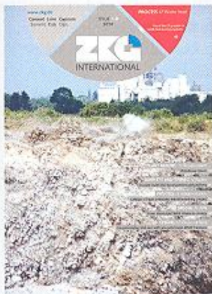
Pinpointed blasting in a quarry at the Hellwegbörde/Germany

NORD DRIVESYSTEMS Intelligent Drivesystems, Worldwide Services