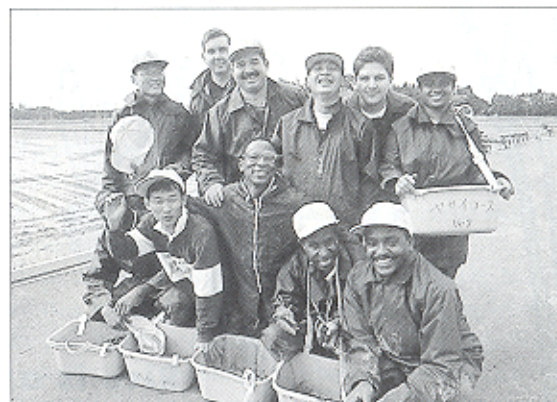
Japan's unique rice cultivation techniques were devised in response to specific problems. (See Main Focus)