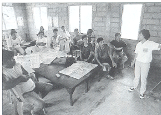
Five farm irrigation groups have been set up at the bottom of the organization. (See Main Focus)