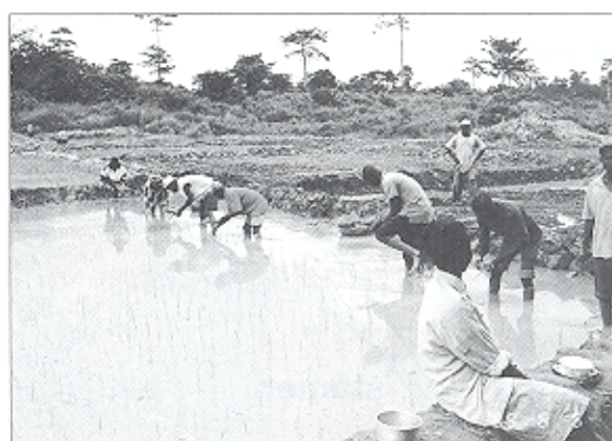
A potential exists for about 20 million hectares of paddies in West and Central Africa. (See Main Focus)