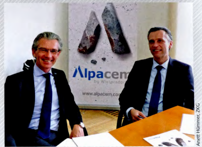
From people to people for generations

Tuning the availability for drivetrains of cement mills 52 GfM Gesellschaft für Maschinendiagnose mbH